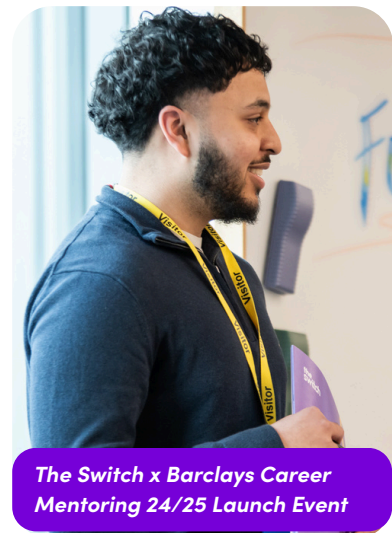
The Switch x Barclays Career Mentoring 24/25 Launch Event

Partner on our mentoring schemes – Provide volunteers while we manage the rest!