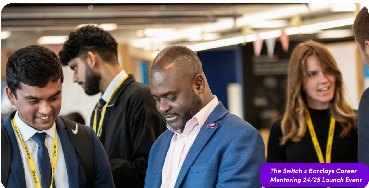
The Switch x Barclays Career Mentoring 24/25 Launch Event